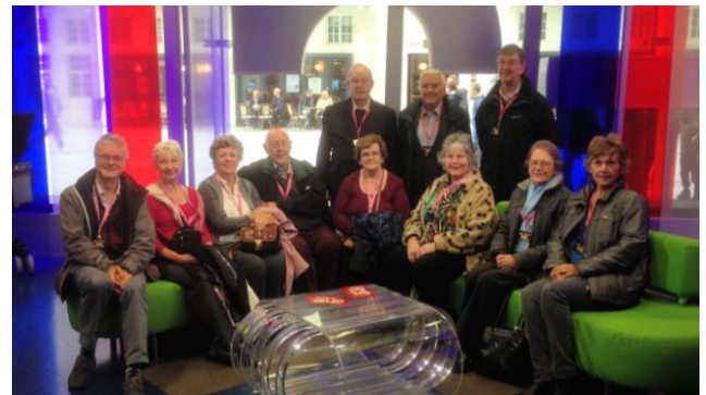
CDWS on the One Show couch

In contrast to the TV facilities we visited the beautiful Art Deco Radio Theatre, which not only is the venue for many music concerts but also has been the home for famous comedy programmes ranging from The Goon Show to the News Quiz.