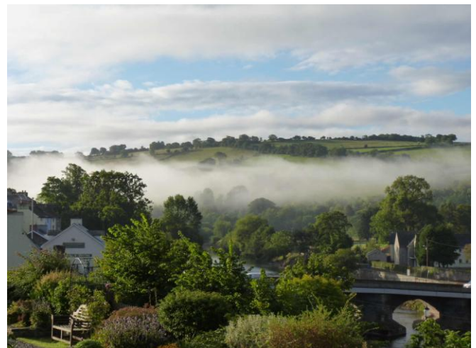
Early morning view from Castle Hotel - Brecon

Not everyone knew of The Castle Hotel's illustrious past, it having been chosen by Alex Polizzi of Hotel Inspector fame to turn it around! The most infamous room was Number 18 and by coincidence, Colin and I were the lucky guests to be allocated this room! All however, was well!