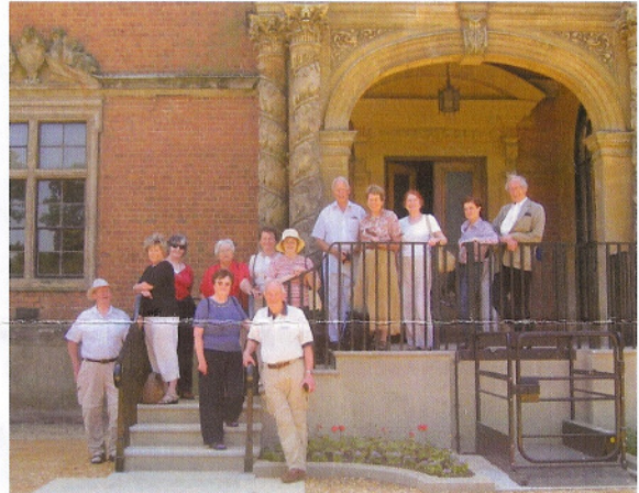
The group at Tredegar House.