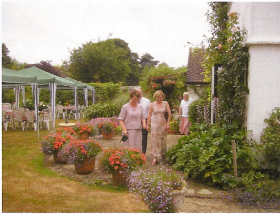
Summer Lunch Day at White Cottage.